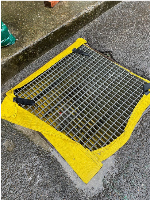
Covered drainage pit