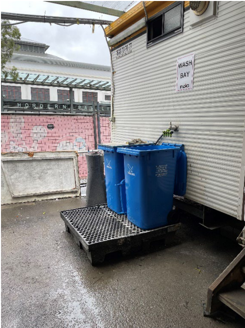
Wash out bins