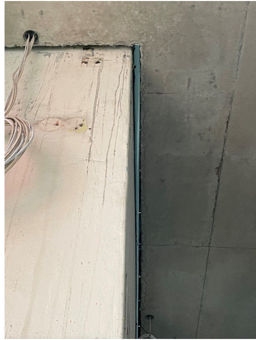
Suspended ceiling showing reversibility of mezzanine floor